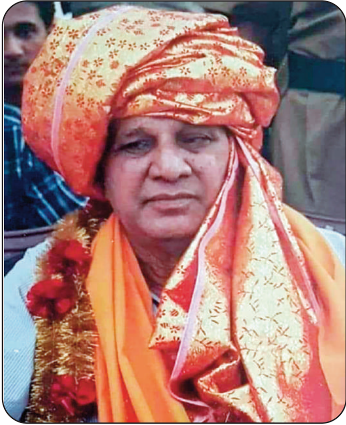
Sahib Shri Kanshi Ram Ji

A community that doesn't have representation in the political power, that community is dead. Sahib Kanshi Ram Ji